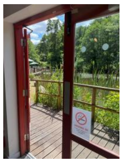
access to outside area from Gallery 1