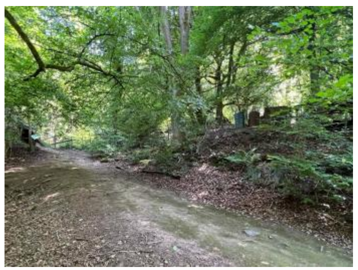
Charcoal Burner's camp