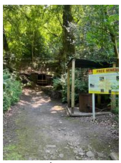
area towards mine opening