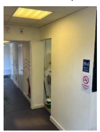
Coffee shop toilets