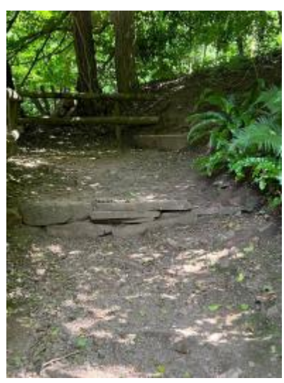
stone step to main flight of steps to mine opening