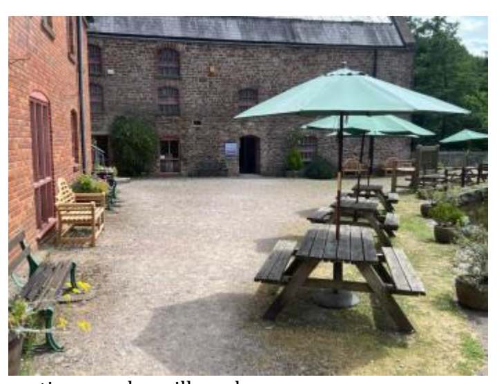
seating area by millpond