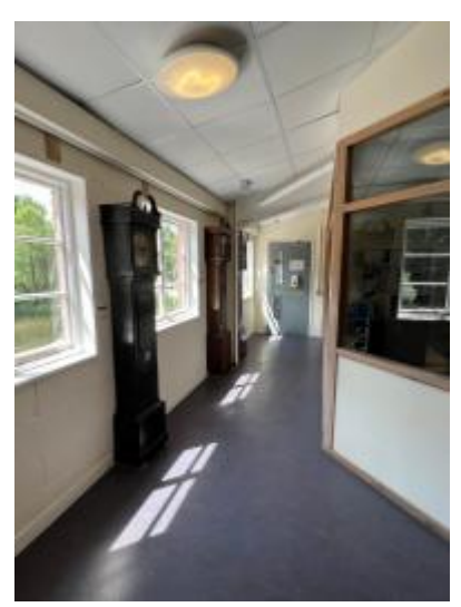
rear entrance to coffee shop on level 1