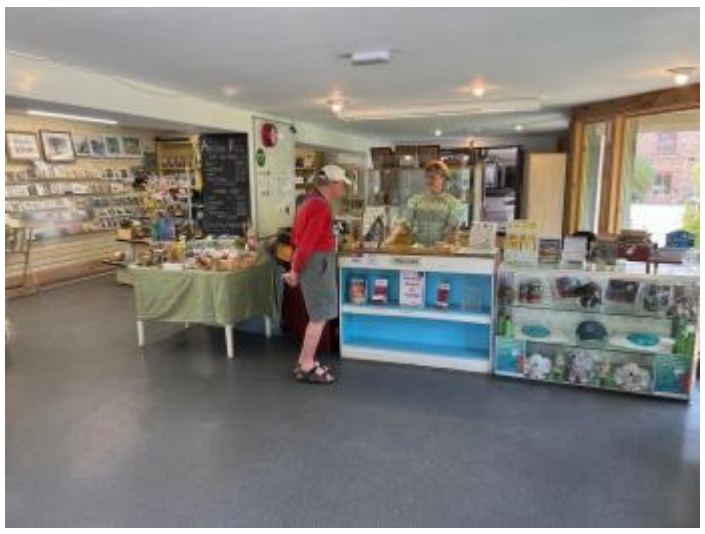
view of reception and entrance to shop