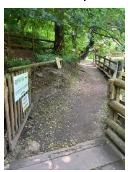
start of Gruffalo Trail