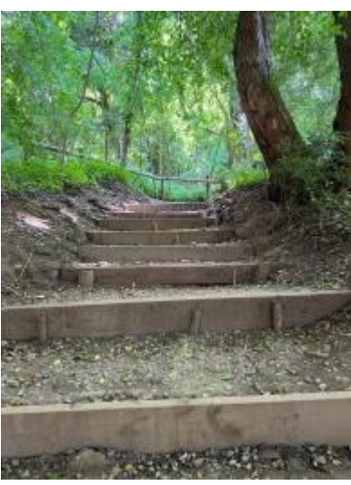
flight of steps to mine