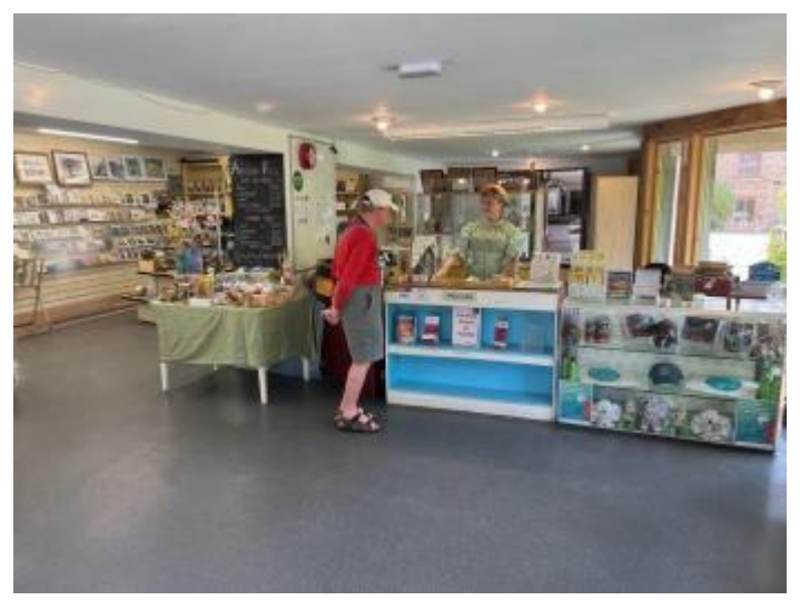
Reception and entrance to shop