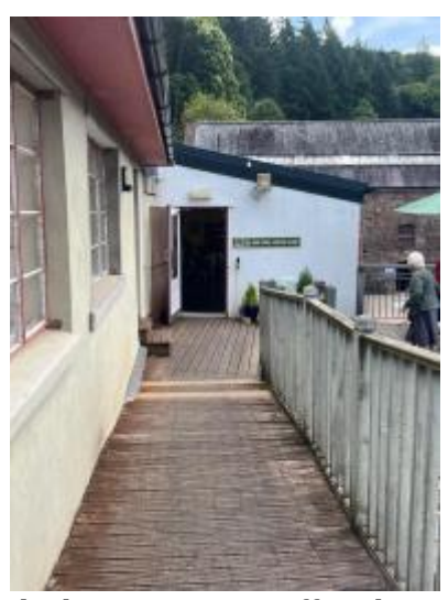
decking ramp to coffee shop