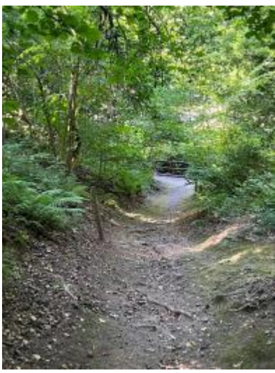
image showing slope from main path as alternative route to charcoal Burner's camp and mine