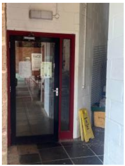
entrance to gallery 5 from ramp on level 1