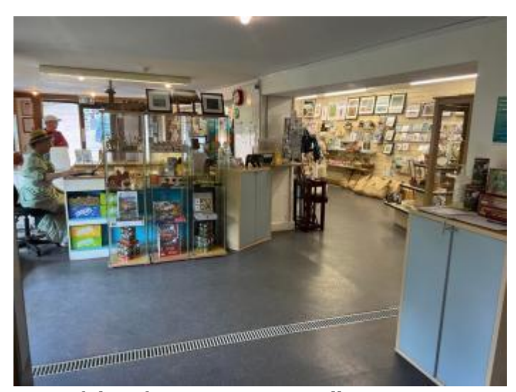
view of shop from entrance to galleries