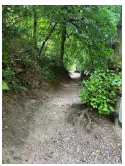
further along woodland path showing tree roots