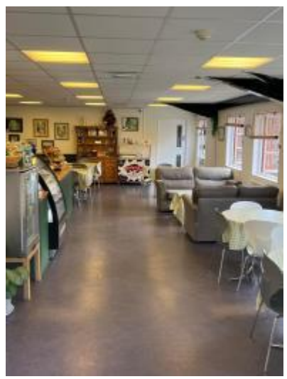
coffee shop showing walk through area