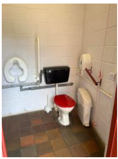
view of disabled toilet