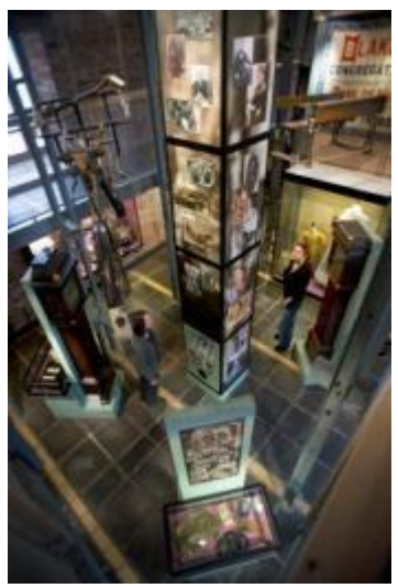
view of Gallery 3 from Gallery 4