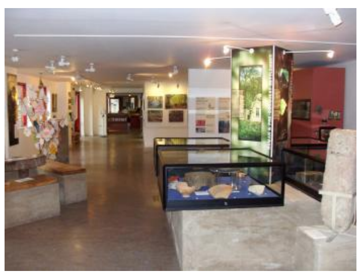
view of Gallery 1 looking towards Reception