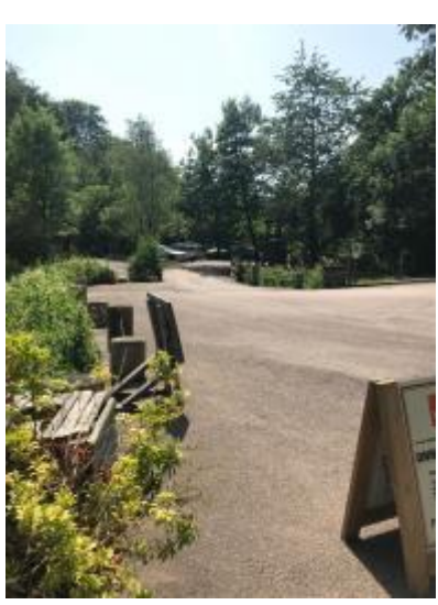
view of car park from entrance doors