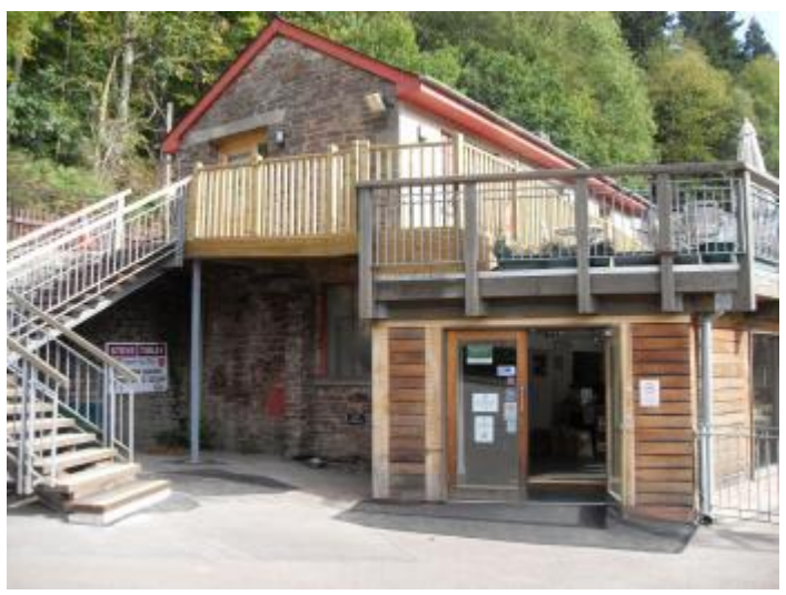
View of entrance