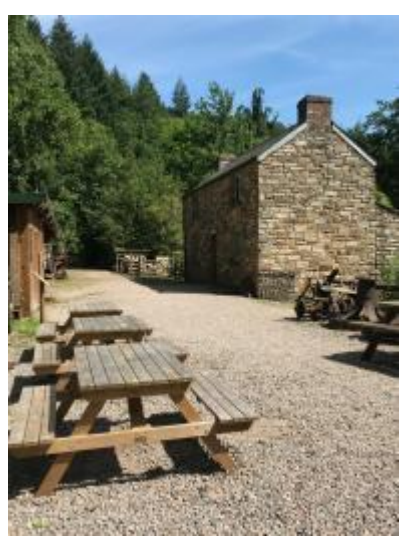
view towards cottage showing gravel walkway