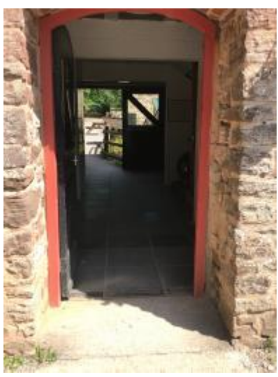
access through mill building towards cottage