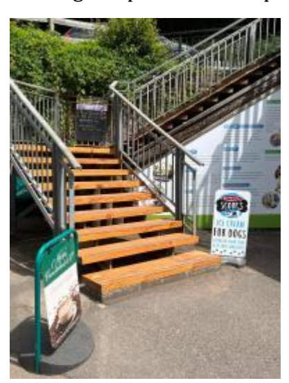
steps to coffee shop by main entrance