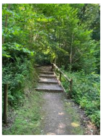
steps on path to charcoal Burner's camp