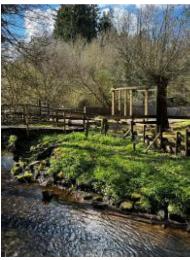
view of access to woodland playground across brook