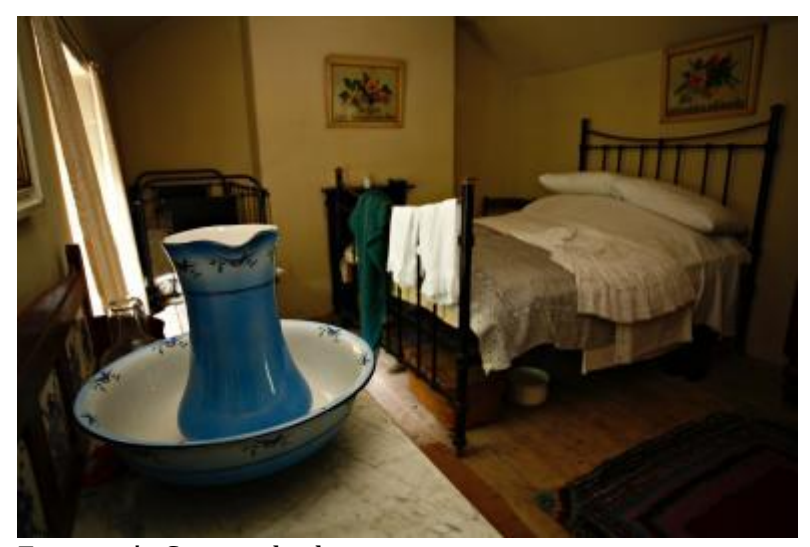
Forester's Cottage bedroom