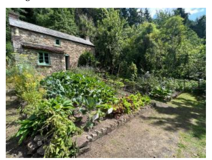
rear of cottage and garden