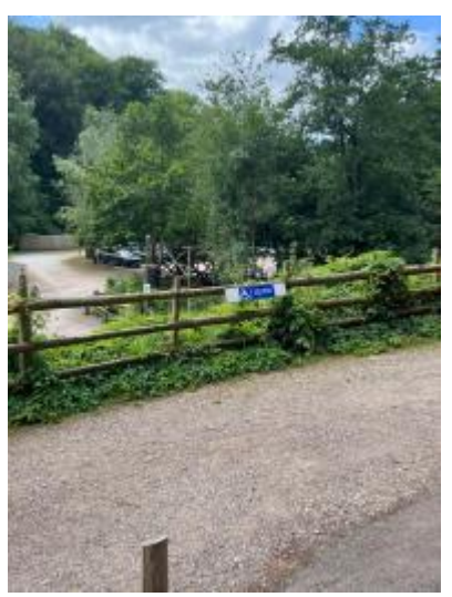
Disabled parking and drop off point for Coffee Shop