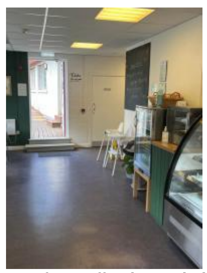
view from coffee shop to decking area showing steps