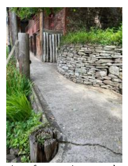
view of ramp going towards toilet block