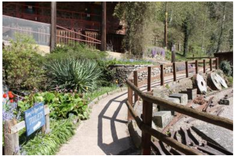
Ramp to 1st floor at rear of building